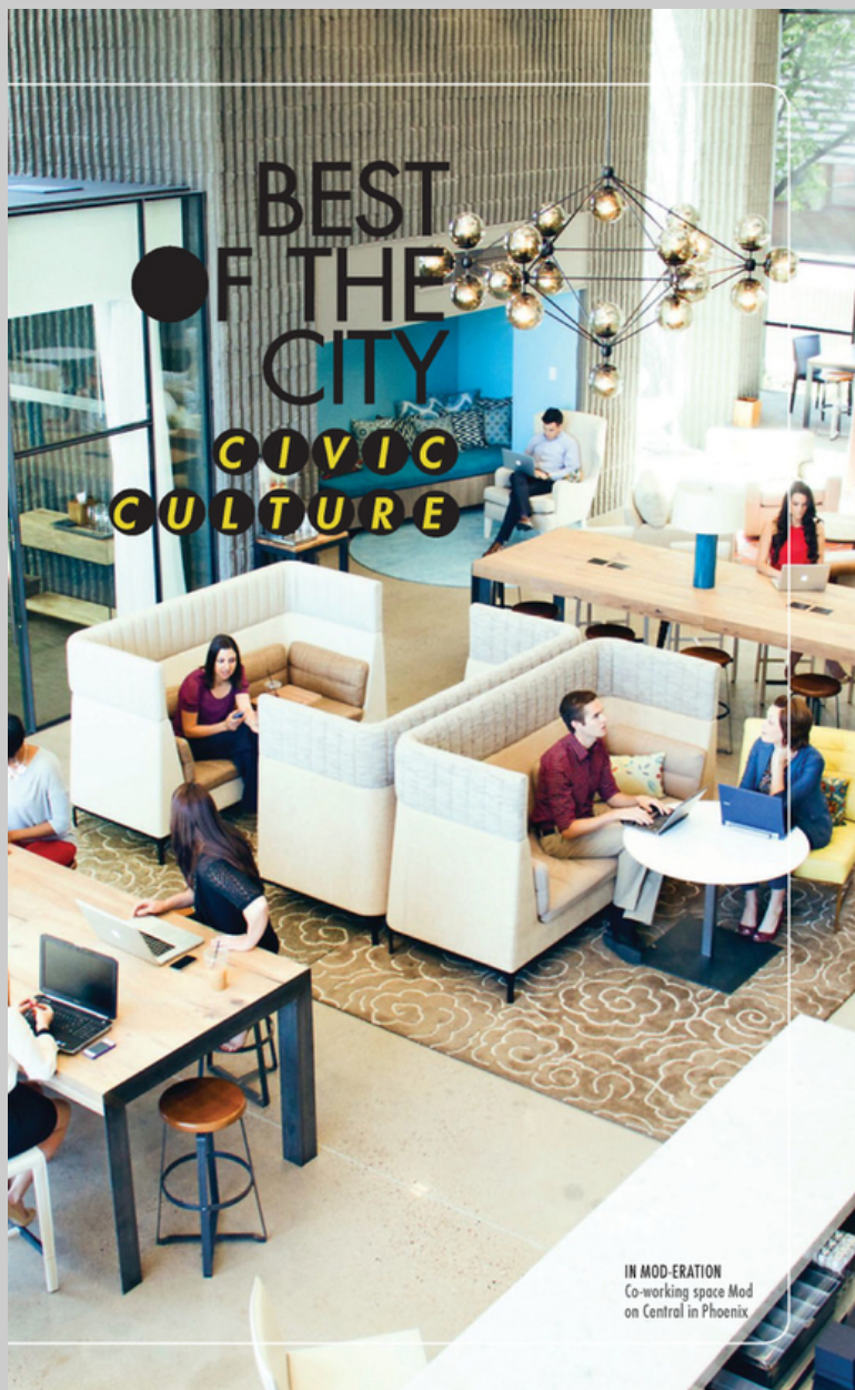
IN MOD-ERATION Co-working space Mod on Central in Phoenix

PLUGGED IN Co-working spaces continue to pop up. One of the most recent, Mod on Central ($7/hour, $350/month, thatsmod.com ) in Phoenix, boasts a boutique hotel vibe, hip furnishings, conference and game room spaces, tech support, an in-house public notary, all-day dining, handcrafted coffee, and even a beer and wine bar. There's also the in-progress, 4,000-square-foot The Creative Center of Scottsdale ( creativecenterscottsdale.org ), which will be geared for artists and boast a coffee and brew house next door. The future of co-working in the Valley looks bright, given local industry leader Co+Hoots ($15/day, $50-$350/month, cohoots.com ) just announced the formation of its foundation, which will engage independent contractors and small businesses to provide pro bono services and education to nonprofits. Expected to be operational by spring 2015, the foundation will be the first co-working space in the world to provide resources to both for-profit and nonprofit companies.